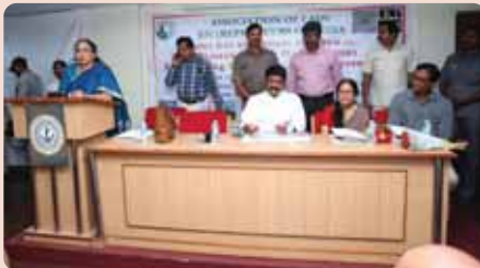
Addressing startup opportunities for women entrepreneurs

Association of Lady Entrepreneurs of India (ALEAP) in association with VCCI organised a Programme on "Biotech Start up Opportunities for Aspiring Global Women Entrepreneurs" to spread awareness on start-up Opportunities in biotechnology and biotech enabled services,. The main objectives of modern bio