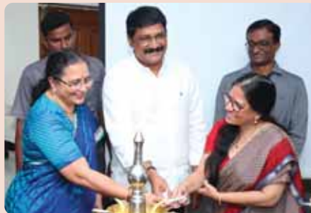
Inaugurating the program

technology are - Heal the world, Fuel the world and Feed the world.