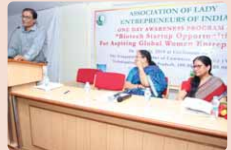
Addressing Challenges of Bio Enterprises